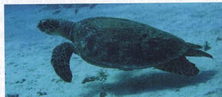
△The always popular turtle.

n't enough to convince me to take the trip yet again, then scuba diving in the Red Sea's pristine waters vs. Belgium's murky waters certainly would be!