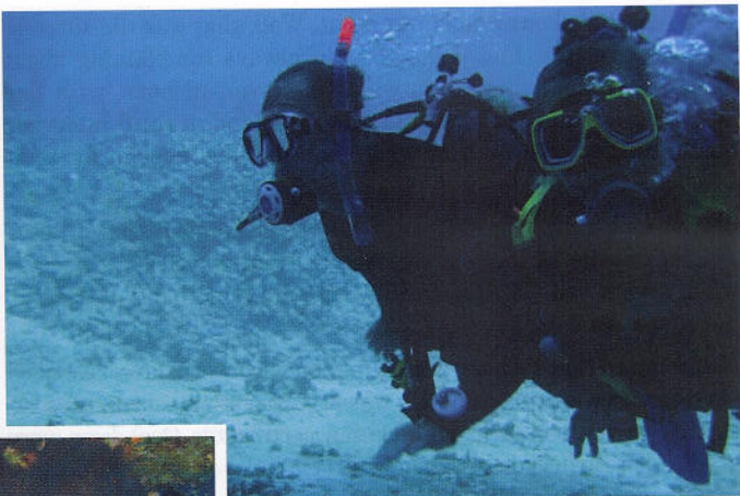
△Old dogs learning new tricks.

Hurghada, Egypt, which has now become a seemingly annual trip for SSAC, takes place in late November/early December. What's not to like about leaving Belgium when it is quickly settling into its winter hibernation of long, dark days and cold, dreary nights?! We're talking 28 degrees vs. 12 degrees! Sun vs. no sun! And, if that was-