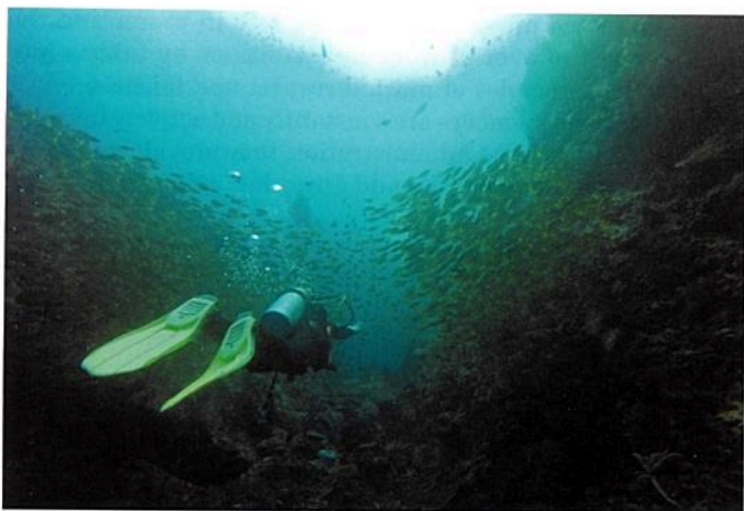
△A school of fish make way for Meghan

This trip had something for expert and novice diver alike. Reef dives, an underwater “jungle gym” of rock formations with swim through tunnels and playing hide and seek with the currents. Since having dove more dives now with the club than I had previously, I notice I am able to see more each time. The intricate details of the tiny nudibranch, known for their vibrant colours. Tentacles peeking out from rocky outcrops where lobsters cram themselves into shallow openings. On a night dive, the spectacle of what looked like decorative lights on black sea urchins were in fact the reflection of many eyes belonging to shrimp who huddle there. The magic of watching an octopus move, changing as it moves to finally blend into its new location.