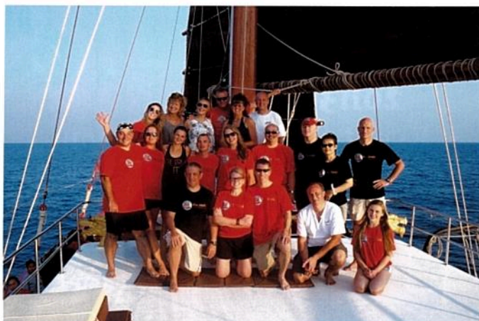
△SHAPE Sub Aqua Club and The Junk under full sail