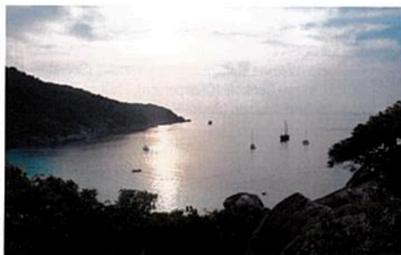
△Similan Island - yup - this is paradise

And the big ticket, the whale shark, who passed once, twice and back the next dive for more. It glided by me and I swam along with it under its belly, watching the remora fish cling and clean its side. On another pass I had to move out of the way to avoid its tail as it turned to venture off. Experiences that will stay with me and have likely raised my expectations for more dives to come! We were good-naturedly chastised by far more experienced divers who informed us it took them