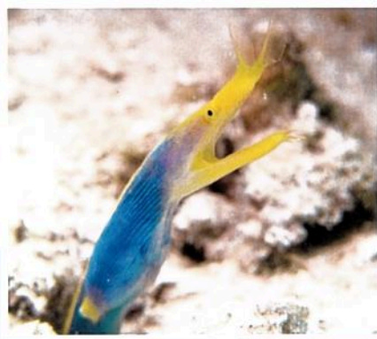
<△Borneo - Ribbon Eel

en their open water certification dives in a Belgian lake or quarry. During this trip, 19 divers completed their Advanced Open Water certification and 17 divers completed their Nitrox certification. Even though I have scuba dove in the Red Sea ten times, it still continues to amaze me. This trip was no exception. We were treated to a small pod of dolphins swimming within arm's length. We also saw a group of six Eagle Rays (the most I've seen together is two) and a Cowtail Ray, which I've never seen before.