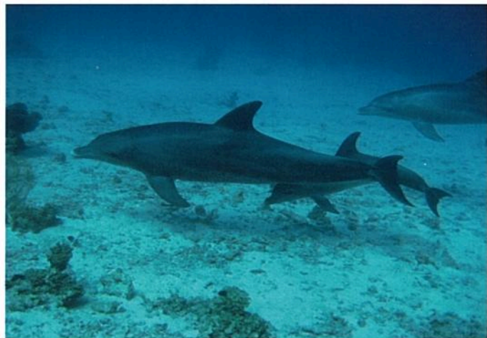
△Hurghada, Egypt - Dolphins

By the time you read this, I will have already returned from another great trip with SHAPE Sub Aqua Club (SSAC). January 23rd through February 5th we will be in Phuket, Thailand for scuba diving on a Chinese sailing vessel called The Junk. This will be followed by a few days in Cambodia exploring the famous Temple of Angkor Wat, and then a few more days in Northern Thailand at Chiang Mai and Chiang Rai visiting The Golden Triangle. But, for now, I'd like to share with you a review of the outstanding places we went to and exciting things we did in 2014. I try to keep the SHAPE community apprised of the scuba trips through articles in the SHAPE Community Life, but 2014 really got away from me and I find that I have not kept up. So, here is a short overview. In April 2014, forty-two SSAC members went to Sipadan-Kapalai Resort in Bor-