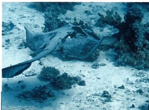
△Hurghada, Egypt - Cowtail Stingray

And if that wasn't enough, we then stopped over