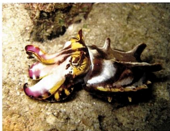
△Borneo - Flamboyant Cuttlefish

time we have taken this specific trip in what we now refer to as the Annual Hurghada Trip and it was, by far, SSAC's biggest trip yet with 47 divers and 19 family members. For a lot of new divers, this is the culmination of recently learned scuba skills and is, by way, a very nice reward to having tak-