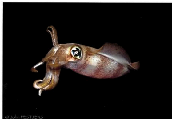
△Hurghada, Egypt - Cuttlefish