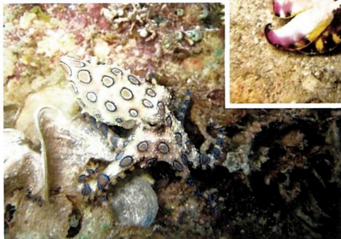
△Borneo, Blue Ring Octopus

time we have taken this specific trip in what we now refer to as the Annual Hurghada Trip and it was, by far, SSAC's biggest trip yet with 47 divers and 19 family members. For a lot of new divers, this is the culmination of recently learned scuba skills and is, by way, a very nice reward to having tak-