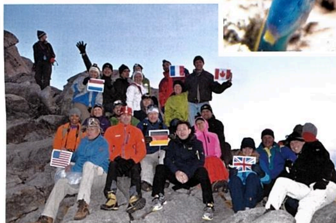
△Mt Kinabalu, Borneo