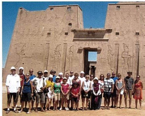
△Edfu Temple, Egypt

November 2014 we were back in Egypt, but this time in the Hurghada area of the Red Sea. This was the seventh