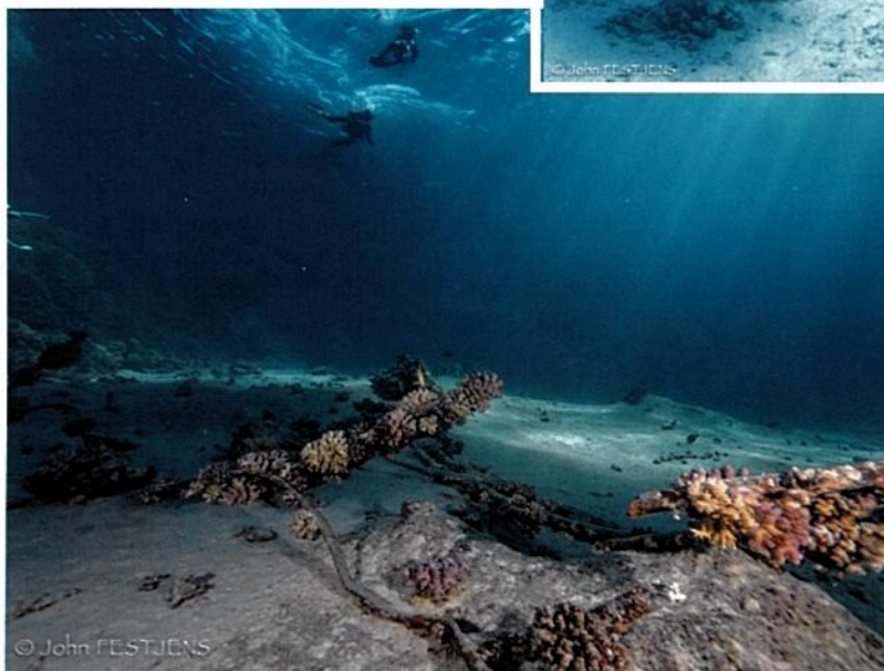
△Hurghada, Egypt - Divers

By the time you read this, I will have already returned from another great trip with SHAPE Sub Aqua Club (SSAC). January 23rd through February 5th we will be in Phuket, Thailand for scuba diving on a Chinese sailing vessel called The Junk. This will be followed by a few days in Cambodia exploring the famous Temple of Angkor Wat, and then a few more days in Northern Thailand at Chiang Mai and Chiang Rai visiting The Golden Triangle. But, for now, I'd like to share with you a review of the outstanding places we went to and exciting things we did in 2014. I try to keep the SHAPE community apprised of the scuba trips through articles in the SHAPE Community Life, but 2014 really got away from me and I find that I have not kept up. So, here is a short overview. In April 2014, forty-two SSAC members went to Sipadan-Kapalai Resort in Bor-