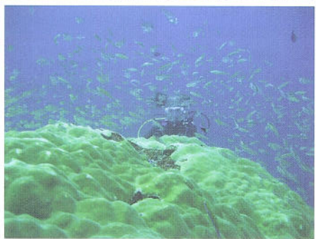
△ Colleen Thompson - living in an aquarium.

And I must mention the seahorse at 30 meters; tiny, yellow, beautiful. I would have never found it on my own – great guides!” One dive offered a unique sighting of a lone giant jellyfish.