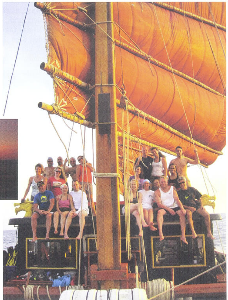
△ Group Picture (L to R):